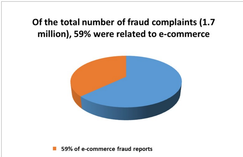
Graph 2.